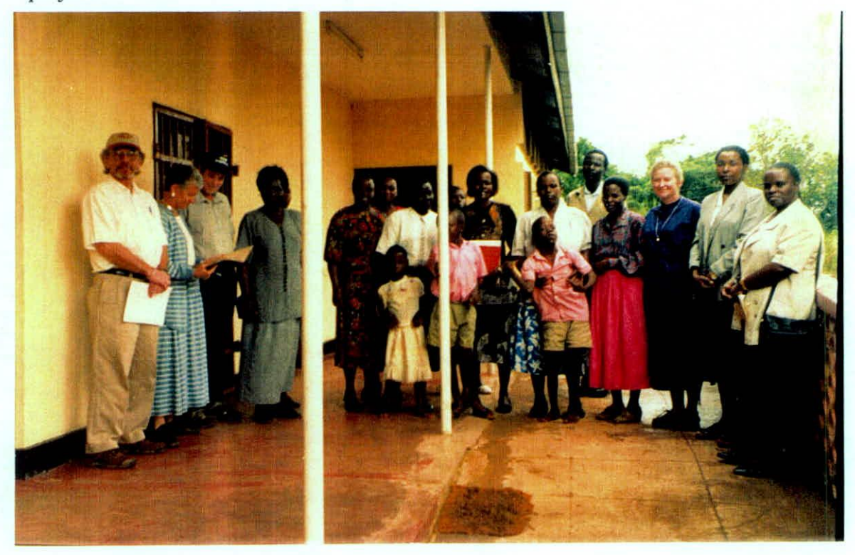
COMBRA staff, CLO, BDEA and USAID staff pose with the US Ambassador

As noted earlier COMBRA was one of the grantees, which were ear marked to host the U.S delegation. Preparations were made to host the USAID delegation and later the U.S Ambassador to COMBRA headquarters. After this the USAID group visited Bwaise CBR project.